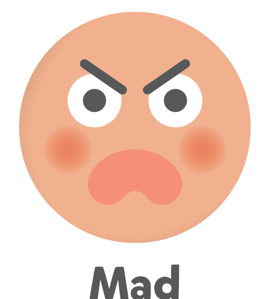
This is how